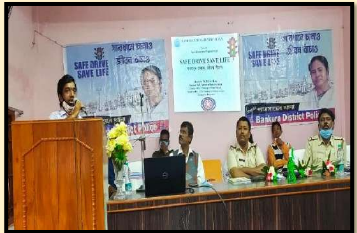
'Safe Drive, Save life' Awareness Programme Conducted by Patrasayer Police Station at college Seminar Hall.