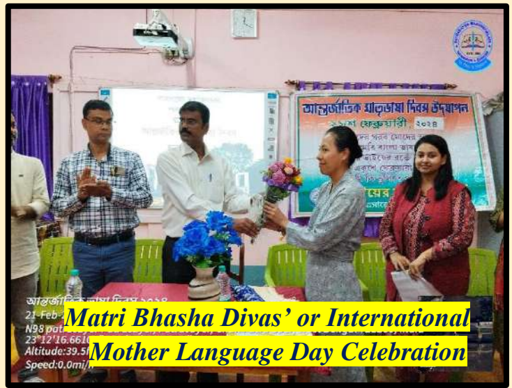
Matri Bhasha Divas' or International Mother Language Day Celebration