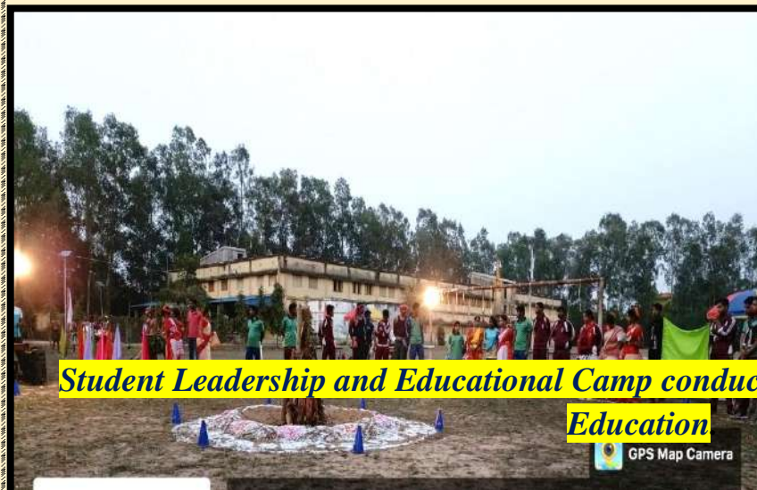
Student Leadership and Educational Camp conducted by the Department of Physical Education