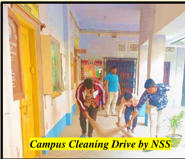
Campus Cleaning Drive by NSS