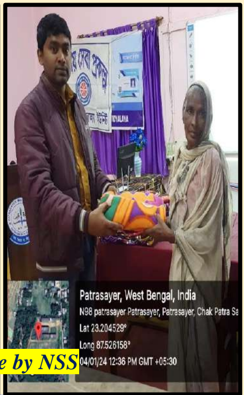
Patrasayer, West Bengal, India N98 patrasayer Patrasayer, Patrasayer, Chak Patra Saer, V Lat 23.204529° Long 87.526158° 04/01/24 12:36 PM GMT +05:30