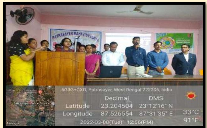
Celebration of International Women's Day with eminent local women and college stakeholders