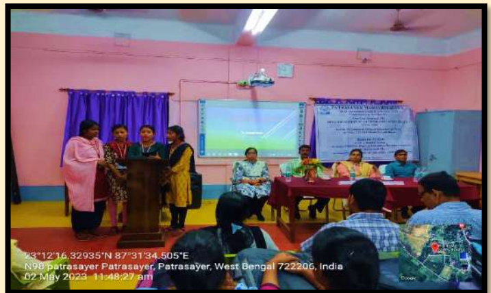
One Day Seminar on "Indumati Bhattacharya: Unsung Heroine of Freedom Movement in Midnapur" jointly organised by the Department of History and IQAC.