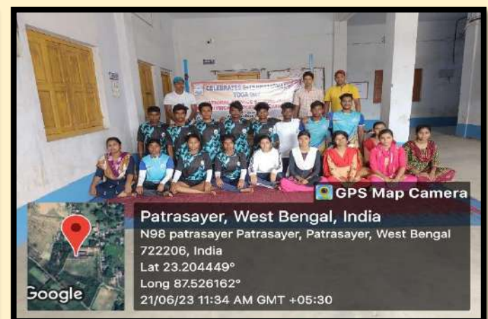
World Yoga Day celebration organized jointly by the NSS Unit and the Department of Physical Education, Patrasayer Mahavidyalaya.