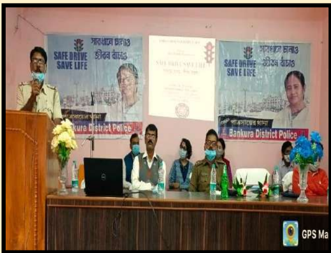
'Cyber Crime' safety Awareness Programme Conducted by Patrasayer Police Station at college Seminar Hall.