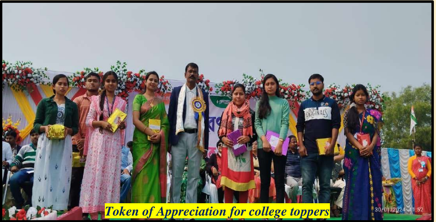
Token of Appreciation for college toppers