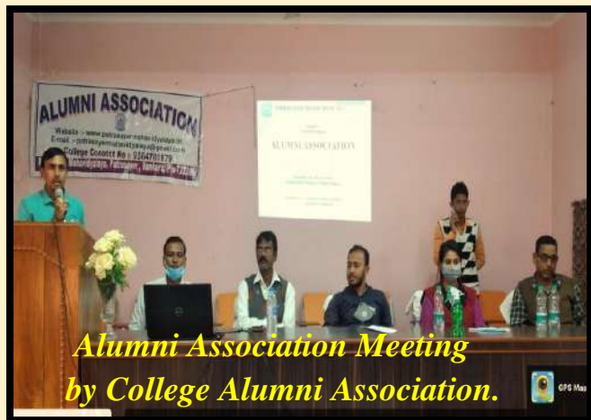
Alumni Association Meeting by College Alumni Association.