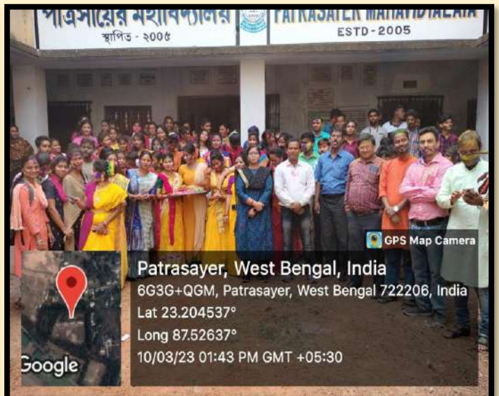
'Basanta Utsav' celebration with student and staff at college Seminar Hall.