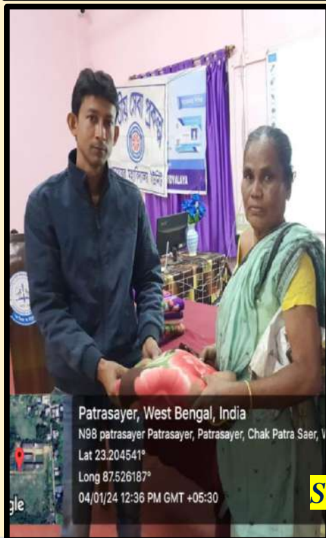
Patrasayer, West Bengal, India N98 patrasayer Patrasayer, Patrasayer, Chak Patra Saer, V Lat 23.204541° Long 87.526187° 04/01/24 12:36 PM GMT +05:30