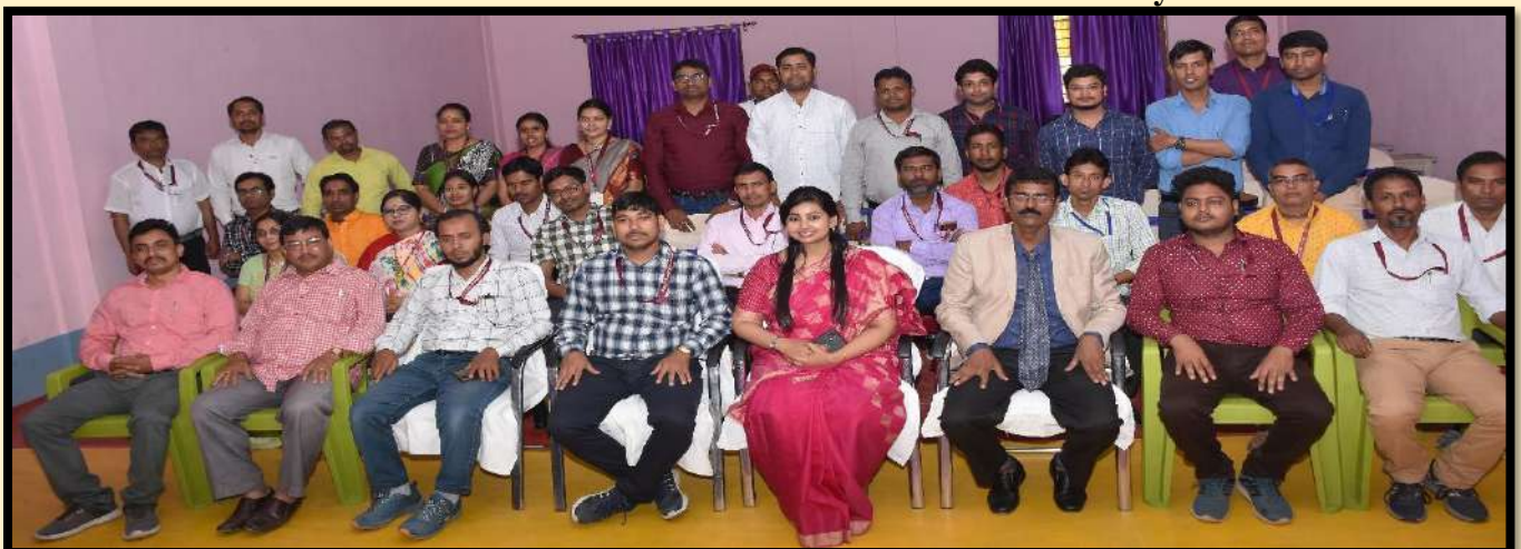
Teaching and Non-Teaching Members of the College