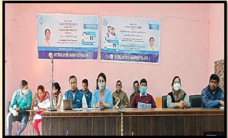
WB Student Credit Card Awareness Camp held at college Seminar hall.