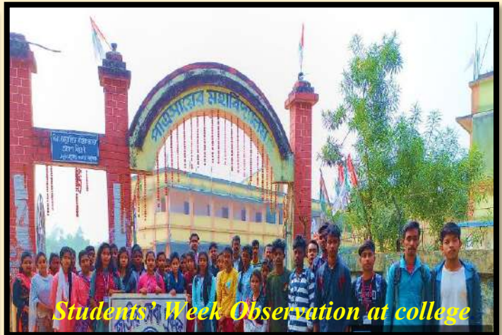
Students' Week Observation at college