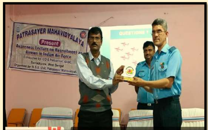
Indian Air Force Recruitment programme Conducted at Patrasayer Mahavidyalaya Seminar Hall by Indian Air Force, Barrackpore base.