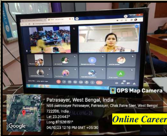
Online Career Counselling Session