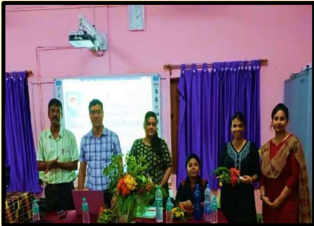
Awareness programme on Mental Health & wellbeing conducted by NSS, & Mental Health Wing, Bishnupur.